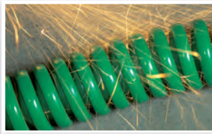
Spiral anti-spark polyurethane tube See page 654