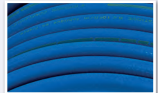
Reinforced antistatic EPDM rubber hose See page 673