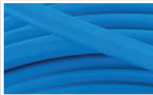
Reinforced water polyurethane hose See page 656