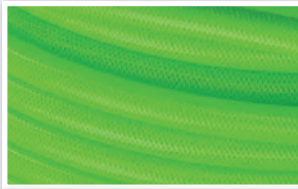
Reinforced hi-vis polyurethane hose See page 655