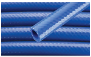
Reinforced polyurethane hose See page 655