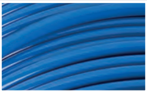
Unreinforced polyurethane hose See page 656