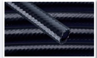
Reinforced anti-spark polyurethane hose See page 654