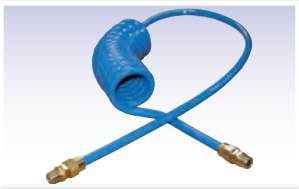
Spiral polyurethane tube & hose kits See page 653