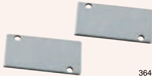
BLANKING PLATES 3 WAY