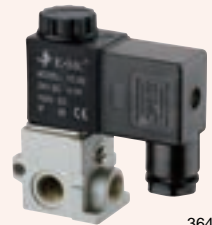
VP SERIES (3/2) SINGLE SOLENOID – 24 V DC