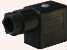
RV SERIES PLUG CONNECTOR (DIN43650/pg9)

IP65 = Dust tight; full protection & protection against directed water jets of low pressure (6.3 mm) from any angle this is only if the DIN plug (DIN43650/pg9) is correctly fitted to coil with the rubber seal in place.