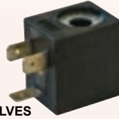
RV SERIES COIL C/W PLUG FOR USE WITH 18 MM BODY SIZE VALVES