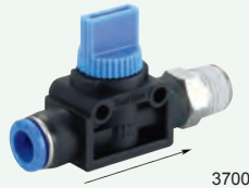
STRAIGHT A VALVE BSPT MALE