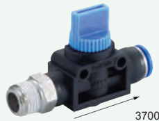
STRAIGHT B VALVE BSPT MALE