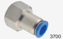
STRAIGHT BSPP FEMALE