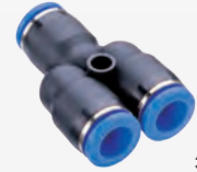
EQUAL UNION Y