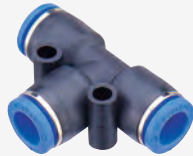
EQUAL UNION TEE