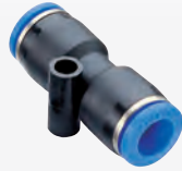
EQUAL STRAIGHT UNION