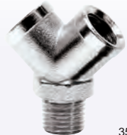
EQUAL 2-WAY Y PIECE BSPT MALE / BSPP FEMALE