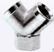
EQUAL 2-WAY Y PIECE BSPP FEMALE