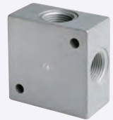
DISTRIBUTION BLOCK BSPP FEMALE