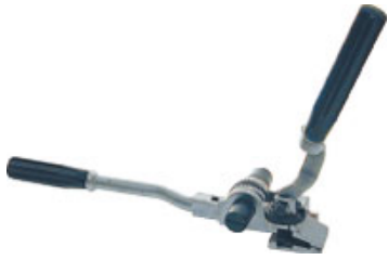
C40099: Ratchet Tool