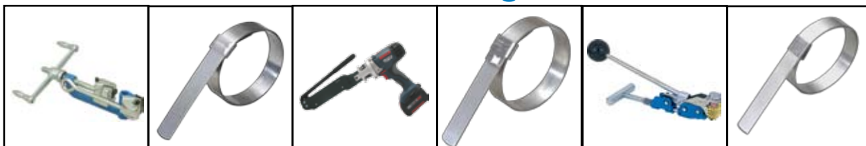
C00269 Junior® Hand Tool