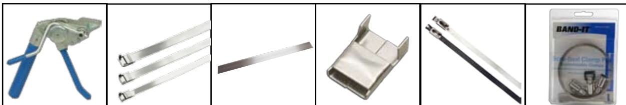
C07569 Bantam Tool