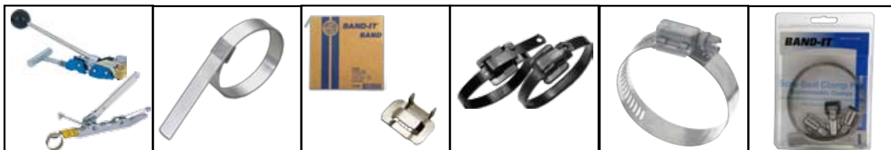
T30069 Center Punch Tool & S03869 Center Punch Tool