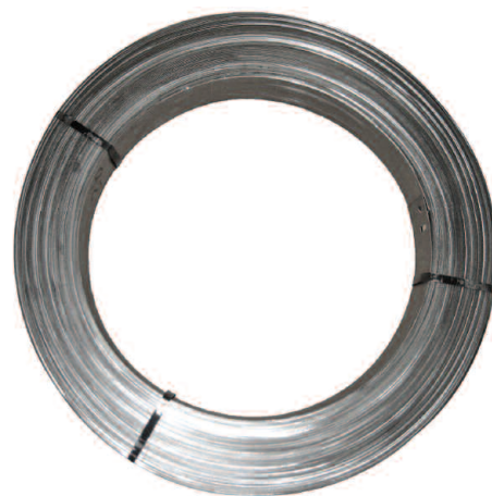
Ribbon Wound Coils