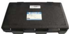
Easy Read Kit