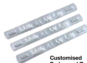
Customised Embossed Tags

Stainless Steel Cable Fixing and Identification Systems