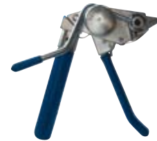
C075 Bantam Tool