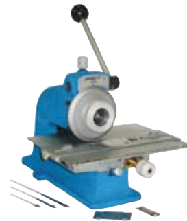
ID Tag Imprinter Tool