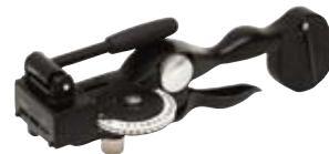
ID4002 Stainless Steel Tape Embossing System