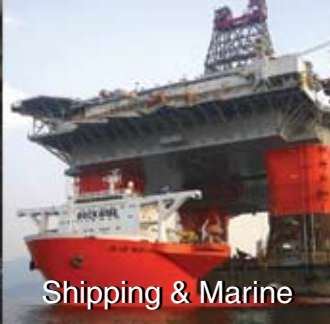
Shipping & Marine