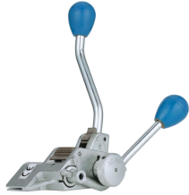
C08569: Bantam Strapping Tool