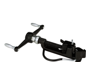
C00369: Heavy Duty Banding Tool