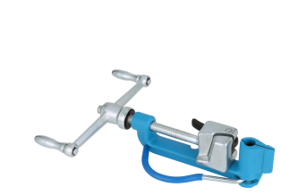
C00169: Standard Banding Tool